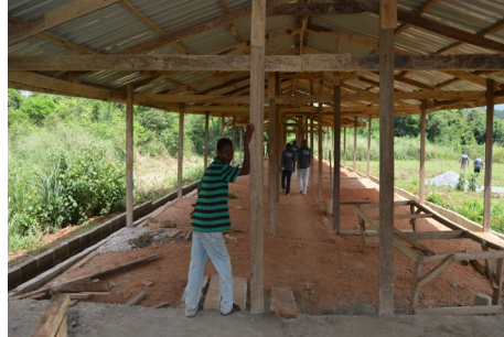
Pig pens under construction